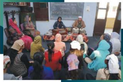
Shabad Recitation by Department of Music