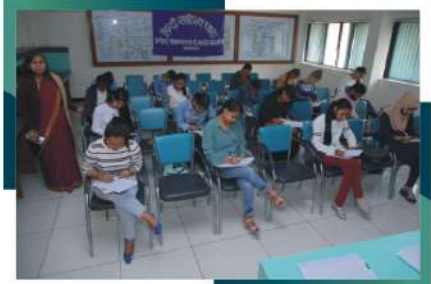
Creative Writing Activity by Department of Hindi