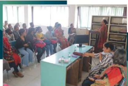
Seminar by Women Empowerment Cell