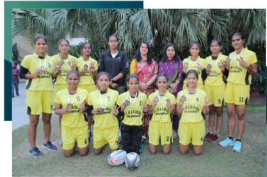
Our College Rugby team got 1 st position in GNDU Rugby Inter-College Championship held on 28 th - 30 th October 2021 at Guru Nanak Dev University, Amritsar