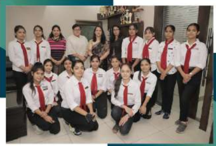
Investiture Ceremony by Department of Computer Science