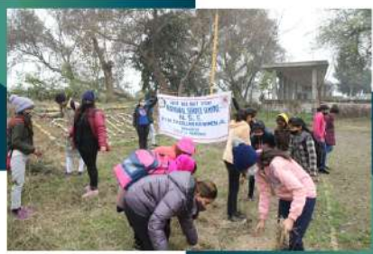
10 Days NSS Camp