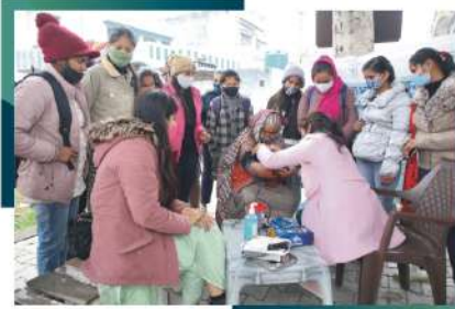
Free Health Check Up Camp