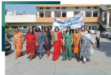
Run for Unity Activity