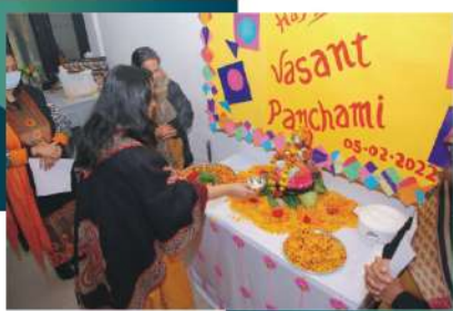
Saraswati Pujan & Basant Celebration