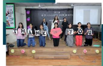
Teacher's Day Fiesta