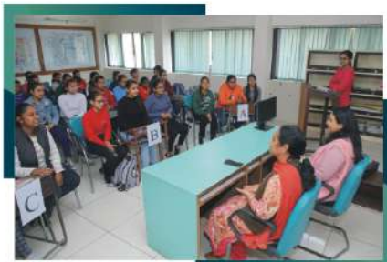
Quiz by Department of History