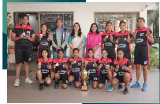
Our College Basketball team got 1st position in GNDU Basketball Inter-College Championship held on 21 st - 23 rd October 2021 at Guru Nanak Dev University, Amritsar