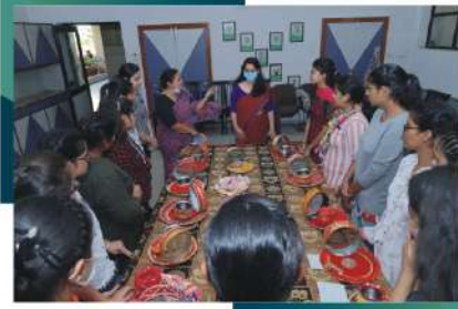
Karwa Chauth Celebration