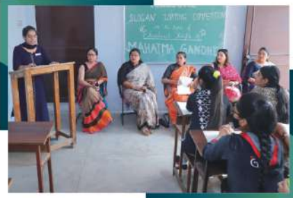
Slogan Writing Contest by Department of B.A. B.Ed