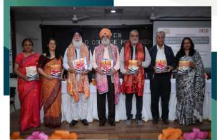
ICHR Sponsored National Seminar