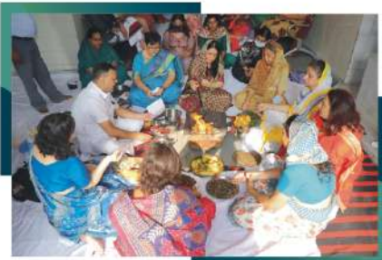
Starting the New Session With Hawan Yajna