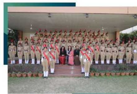
National Cadet Corps.