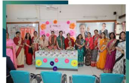
Women's Day Gala