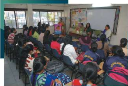
Celebrating Maa Boli Diwas