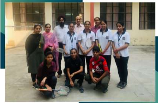
Our College Badminton team participated in GNDU Basketball Inter-College Championship held on 21st - 23rd October 2021 at Doaba College, Jalandhar