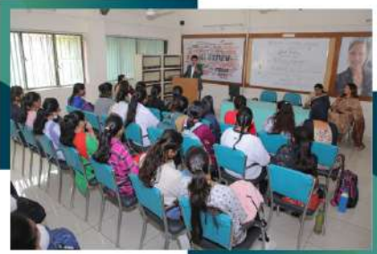
Guest Lecture by Department of English