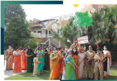
75th Independence Day Celebration