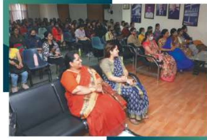
Seminar on Aptitude by Department of Commerce