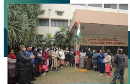
Republic Day Function