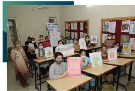
National Support Services