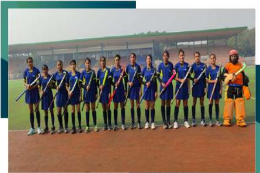
Our College Hockey team got 1st position in GNDU Hockey Inter-College Championship held on 28th - 30th November 2021 at Guru Nanak Dev University, Amritsar.