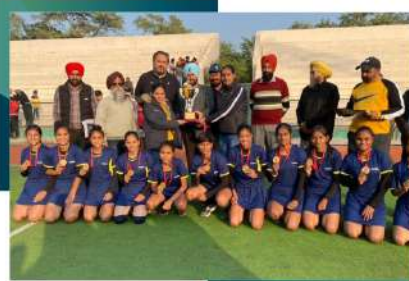
Winners of Hockey Inter College Championship 2021-2022