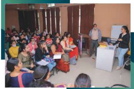
Workshop on Innovative Banking by Department of Economics