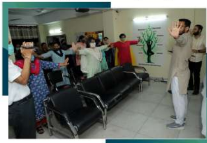
Art of Living Workshop by Department of Yoga & Meditation