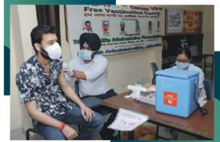
Free Vaccination Camp