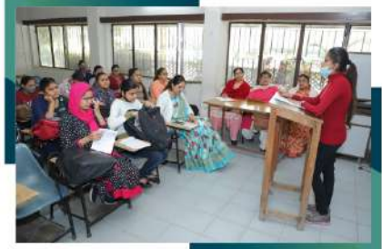
Debate Competition by Department of Punjabi