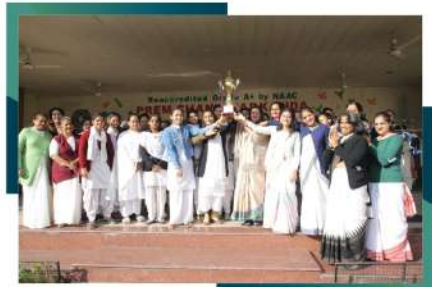
Overall Trophy in GNDU C-Zone Youth Festival (B-Division)