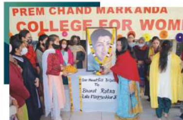
A Tribute to Lata Mangeshkar