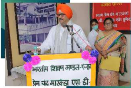
National Seminar by Bhartiya Shikshan Mandal