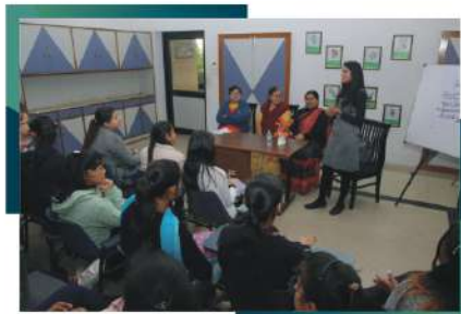
Guest Lecture by Department of Home Science