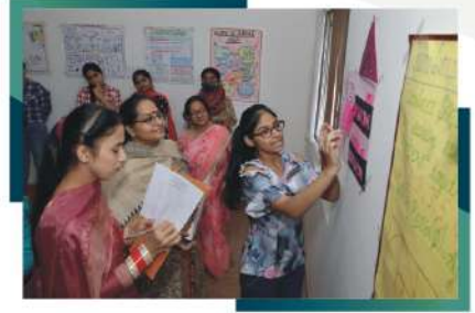
Poster Making Competition by Department of Mathematics