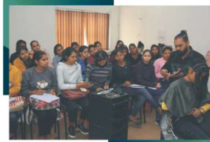
Workshop by Department of Cosmetology