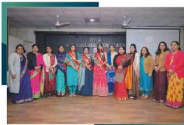
Fashionista & Neo Fest (Fresher's Party)