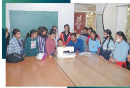
Workshop by Department of fashion Designing