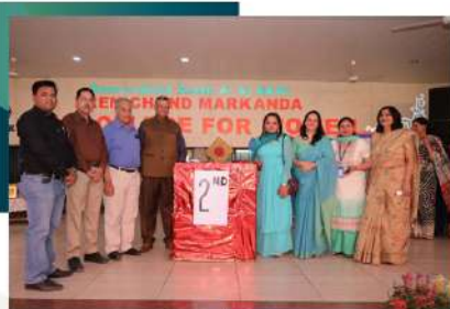
47th Annual College Fete Lucky Draw