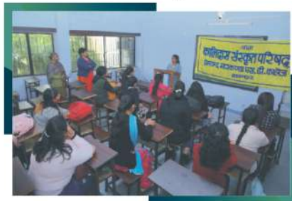
Shloka Recitation Competition by Department of Sanskrit