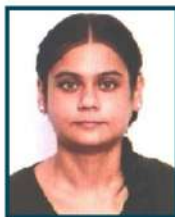
Vaishali President Youth Club