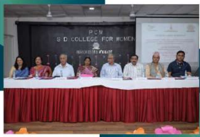
ICSSR Sponsored International Conference on Ramayana